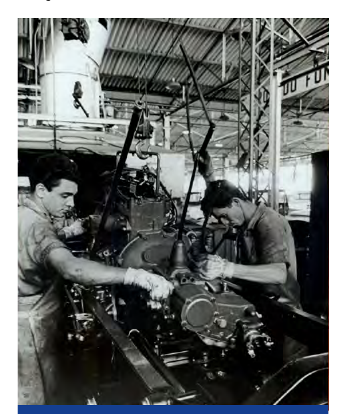
Jeep plant in Sao Paolo, Brazil.

Bank generally paid higher interest rates abroad than in the United States. "We're willing to pay a little more to borrow abroad merely to keep the various markets open, and we're willing to pay something for the fact that we are an international organization, and this is a step in broadening the understanding of the World Bank by borrowing in these various markets,"14 he said. Cavanaugh added that part of the reason for selling bonds abroad was that the World Bank wanted to make loans in those foreign currencies.