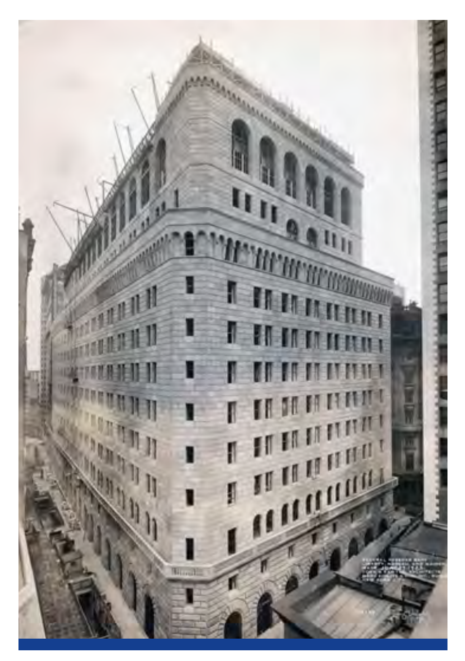
Federal Reserve Building in New York.

The bond offering was lead managed by Morgan Stanley—marking the start of its long-standing relationship with the World Bank. Both institutions were delighted by their newly forged relationship. For the World Bank, the link to Morgan Stanley meant access to a deep reservoir of institutional knowledge and expertise in the capital markets and myriad connections in international finance. For Morgan Stanley, the World Bank was a prestigious new client. The firm took great pride in being able to describe itself as the banker to the World Bank.<sup>5</sup> In selling the World Bank to initially skeptical U.S. investors, Morgan Stanley—together with First Boston (a predecessor of Credit Suisse), which was chosen as part of the team to market the bond-organized syndicates of underwriters and put on road shows in 18 cities to attract interest from investors and securities dealers.