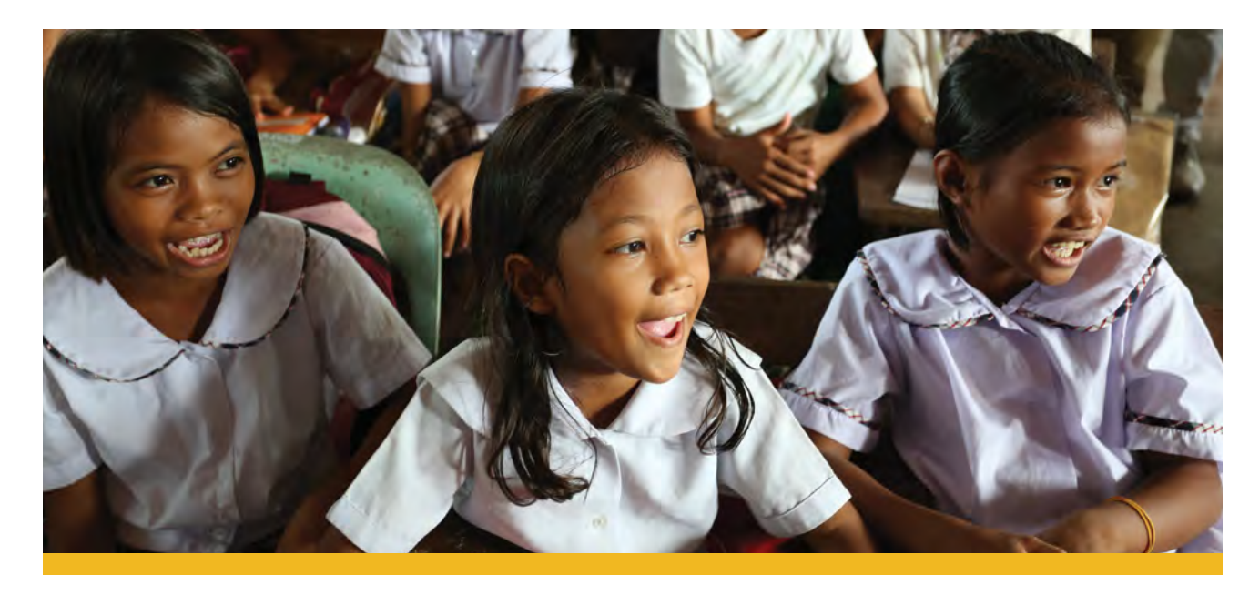
Students from the Bislig Elementary School at their newly-repaired classroom in Bislig, Tanauan City in Leyte province, Philippines on July 13, 2014.

He said, one crucial factor behind the conservative financial stewardship was that the incentive structure under which the World Bank Treasury team operated had not been skewed toward excessive risk-taking, which would have kept the World Bank in highly exposed positions when vulnerabilities came to light. Team members in the Investment Management Department had concluded as early as late 2006, when yields on these assets were still high, that major risks were developing and had reduced exposure accordingly.