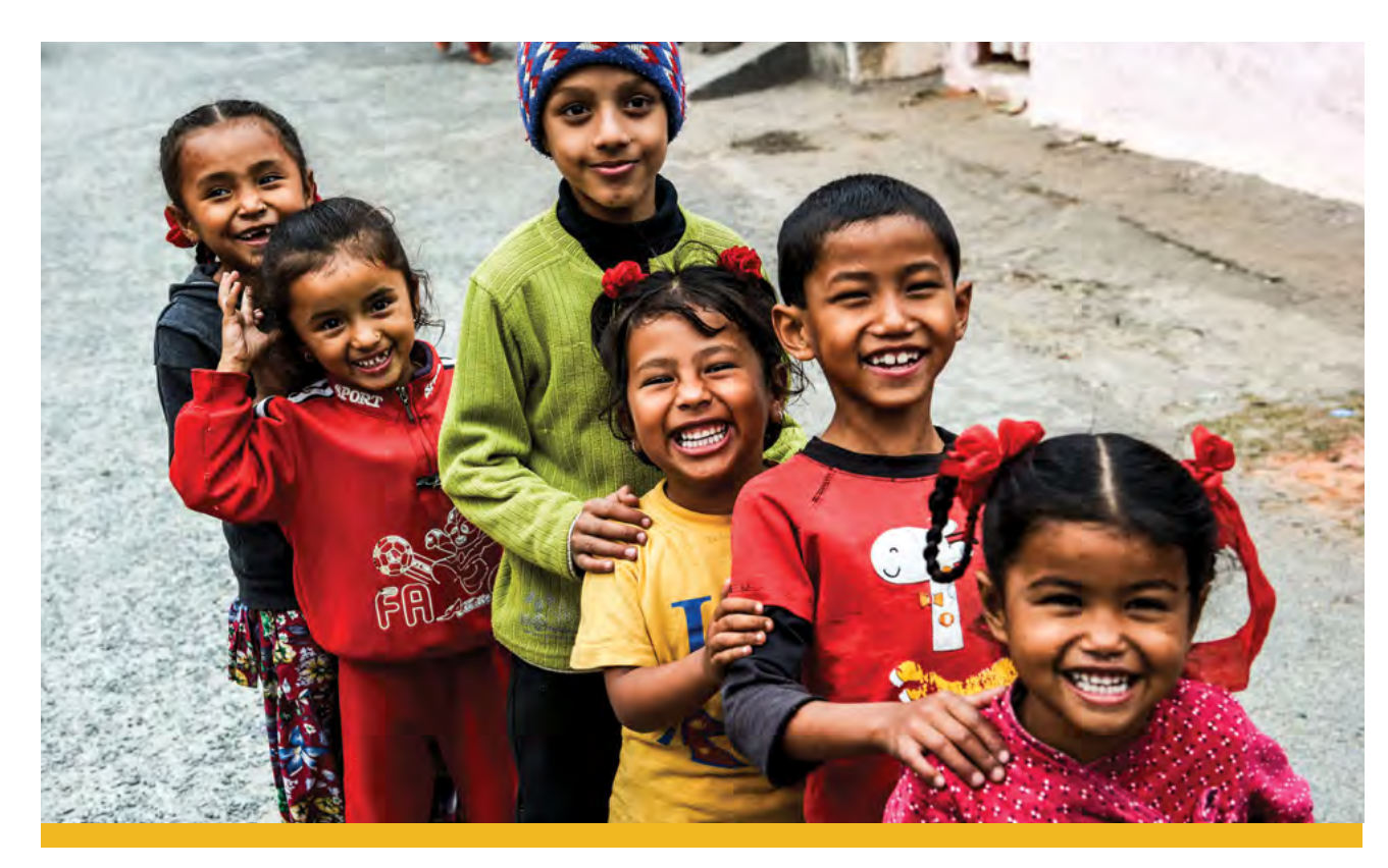
Nepalese children celebrating on the day Nepal becomes the first country in the world to use support from GAVI, the Vaccine Alliance to begin protecting its children with Inactivated Polio Vaccine (IPV). The introduction is part of a plan to ensure that IPV will be available to millions of children in GAVI-supported countries through the introduction of the vaccine into routine immunisation systems (2014).

70 Years Connecting Capital Markets to Development