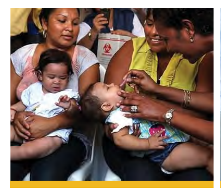
In conjunction with Vaccination Week and World Immunization Week, Haiti introduced pentavalent vaccines in partnership with GAVI. Its target: protect more than 200,000 children against five deadly diseases: diphtheria, tetanus, pertussis (also known as whooping cough), Haemophilus influenzae type B and hepatitis B (2014).