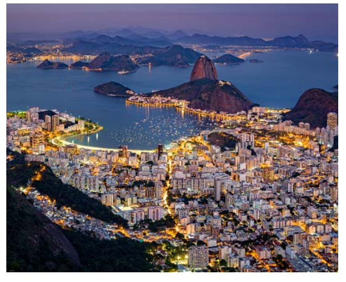
Aerial view of Rio de Janeiro.

The FINBRAZEEC project aims to unlock private