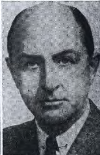
Eugene R. Black.