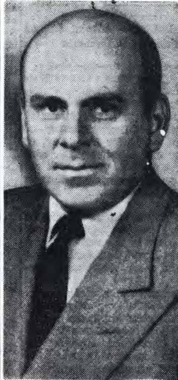
John J. McCloy President