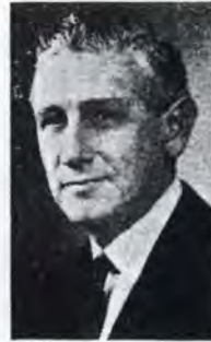
John J. McCloy