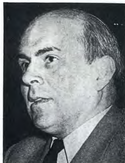
John J. McCloy

John J. McCloy, big-time corporation lawyer and former Assistant Secretary of