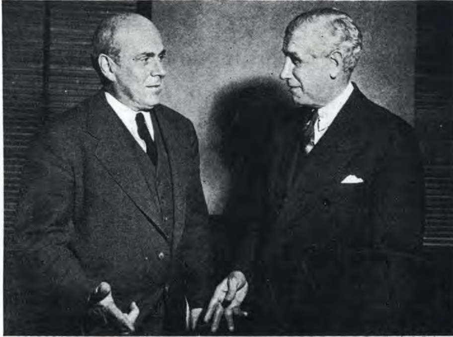
—Harris & Ewing