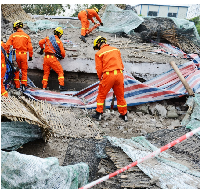
Earthquake recovery.

The Pacific Alliance is a regional initiative that promotes the economic integration of Chile, Colombia, Mexico, and Peru in order to drive members' mutual growth and development. The four countries are situated along the western part of the seismically active Pacific