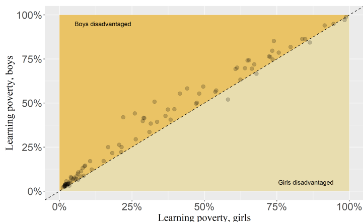
Figure 2. Gender Gap - Learning Poverty by Sex

Notes: (1) No gender split in Learning Poverty is available for Congo, Dem. Rep.. Only countries with data displayed; and, (2) The closer a country is to the dotted line the smaller its LP gender gap.