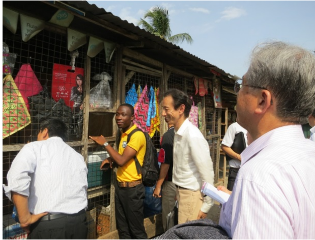
Site visit of the Ghana Nutrition Improvement Project (Ajinomoto)