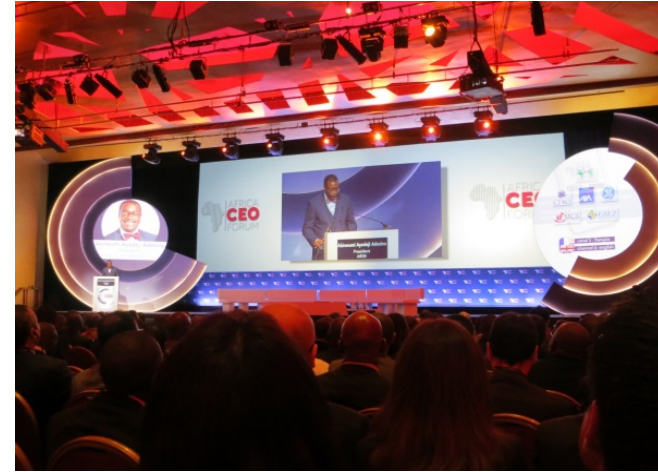
Africa CEO Forum