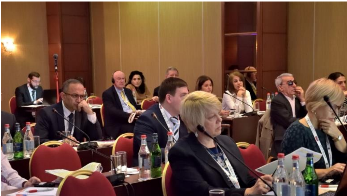
Session participants at The First Annual Conference on Technical Assistance to Support the READ Program (November 13-15, 2016) in Armenia.