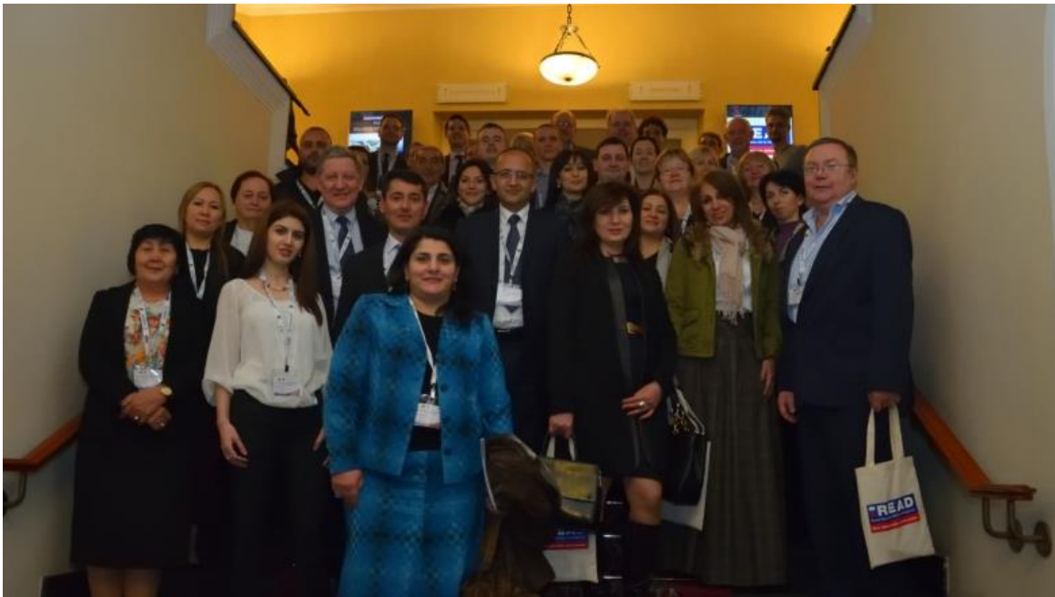
Participants at The First Annual Conference on Technical Assistance to Support the READ Program (November 13-15, 2016) in Armenia.

The aim of the READ 2 RAS Program is to develop Russia's institutional, expert, and research capacity in the area of education development aid and support the application of this capacity to improving the quality of basic education systems in low- and middle-income countries. Related work to be carried out by Russia's CICED over the next few years includes a cross-country study on education quality in several ECA countries.