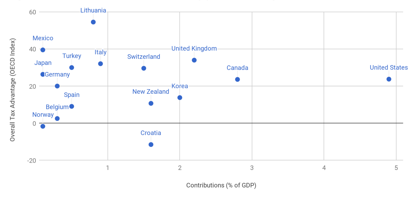
Figure 17. Cost effectiveness of voluntary pension arrangements, contributions