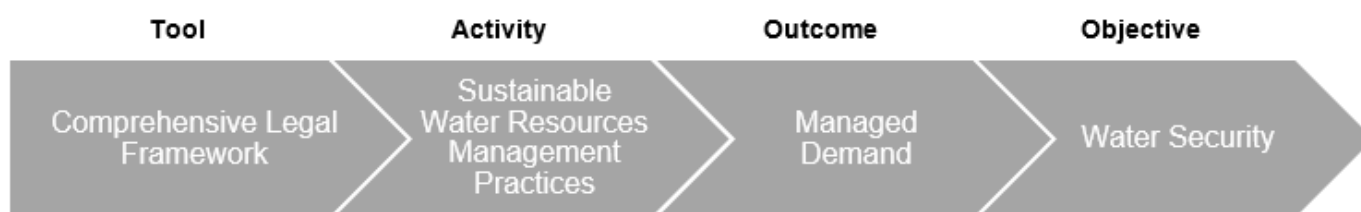
Figure 1. Linking the legal framework with water demand management and water security.

Progress on water demand management in the coming decades will require an “all hands-on deck” approach with the effective use of all tools available to governments and the recognition of multiple perspectives. 29 Thus, for example, water demand management has been approached from the perspectives of environmental psychology and water user behaviors, on-farm technologies, institutional design, social innovation, and economics, among others. 30 The subject of this note is one additional tool available for countries: the legal framework , a.k.a. the hierarchy of legally-binding instruments from the constitution to laws, regulations, and subsidiary legal instruments. This note intends to review and focus the ongoing discussion of the potential role that the legal framework – and by extension, legislators and regulators – can play in supporting water demand management in the coming decades.