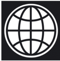
The World Bank