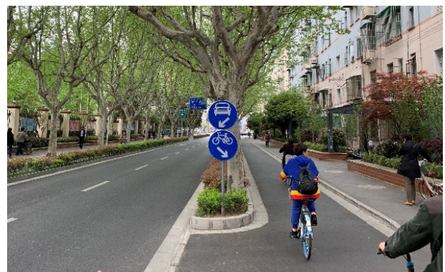
Zhengtong Road, Shanghai, after road safety upgrades implemented, April 15, 2019

Presentations and discussions focused on strategic road safety policies for decision makers, including a session on road safety policies and strategies, delivered jointly by the head of GRSF and Jiaozuo project management delegates. The following day was geared towards technical-level specialists and included an introduction to road safety engineering tools by the World Bank, iRAP case studies from BIGRS work, and China-specific case studies from ChinaRAP. Soames Job, Head of the GRSF provided an overview on speed management, e-bikes and heavy vehicles, while WRI, NACTO-GDCI and Shanghai Urban Construction Design and Research Institute presented safe and sustainable design strategies and held