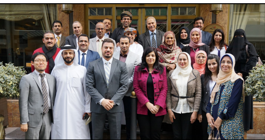
ICP-Western Asia Workshop, Istanbul, Turkey (December 8-11, 2014)