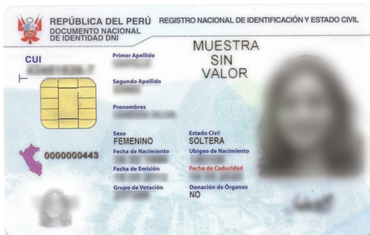
Figure 2: Peru Electronic DNI