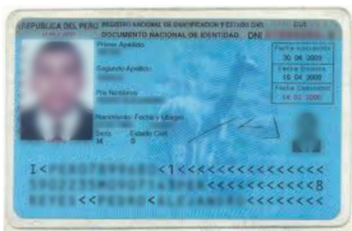
Figure 1: Example of Peru’s National Identification Document (DNI)

33. The national ID number or CUI has 8 digits, which follow a sequential order. The DNI has to be renewed